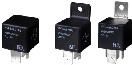
NVF4-3 29×29×26.5 NVF4-4 29×29×26.5(+16)